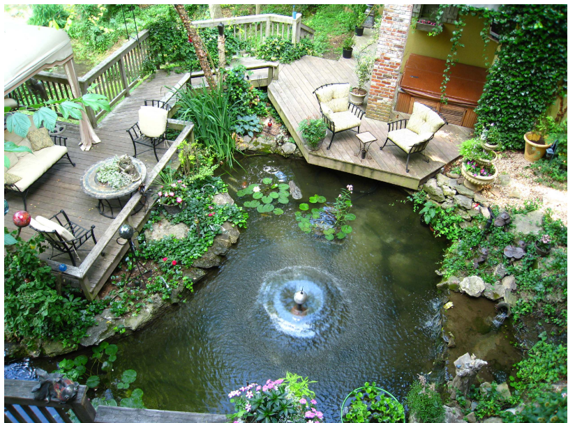
The "Waterfall House" from 2010 Pond Tour