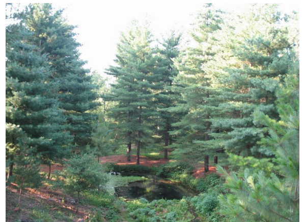
Lovett Pinetum at our SWS meeting in 2008

We will have a short business meeting before the program.