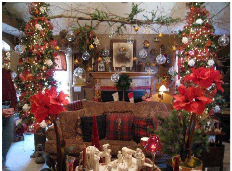
Scottie Snider's as seen on Christmas tour November 6, 2010

These are nice size Japanese koi about 11" to 13" size. Fish are located near St. John's Hospital. Please call Alan or Chris at 417-844-1437.