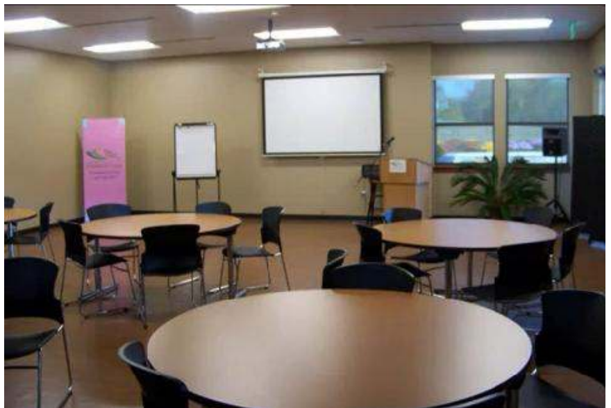
Meeting room at the new Botanical Center

What, if any, responsibilities should be part of membership?