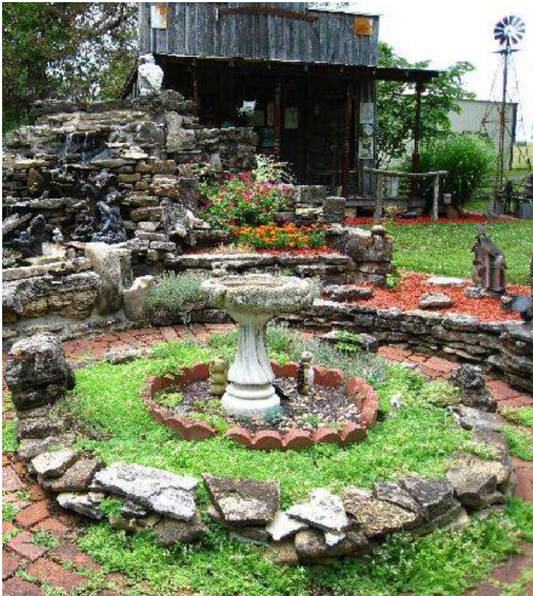
The Martin's during 2010 pond tour